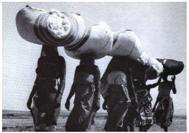
Figure 2: Women carrying cotton loads to a buying post